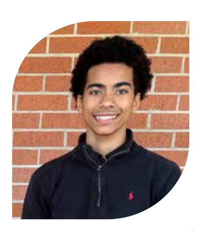
is in 10th grade, and this is his first year back at St. Luke's. He plays basketball and is interested in joining chess club.